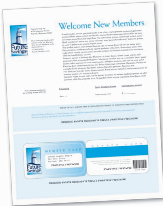
Suitable for most digital (laser) printing, as well as commercial printing and ink jet compatible